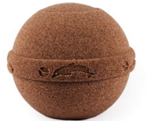
Limbo Samsara Urn

For ground burial, water disbursement or tree planting