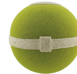
Limbo Olea Urn

For home or niche storage as well as ground burial