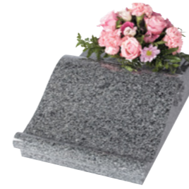
Desk Top Memorial

Serving as grave markers and cremation containers these markers provide a lasting tribute and a place for family and friends to pay their respects.